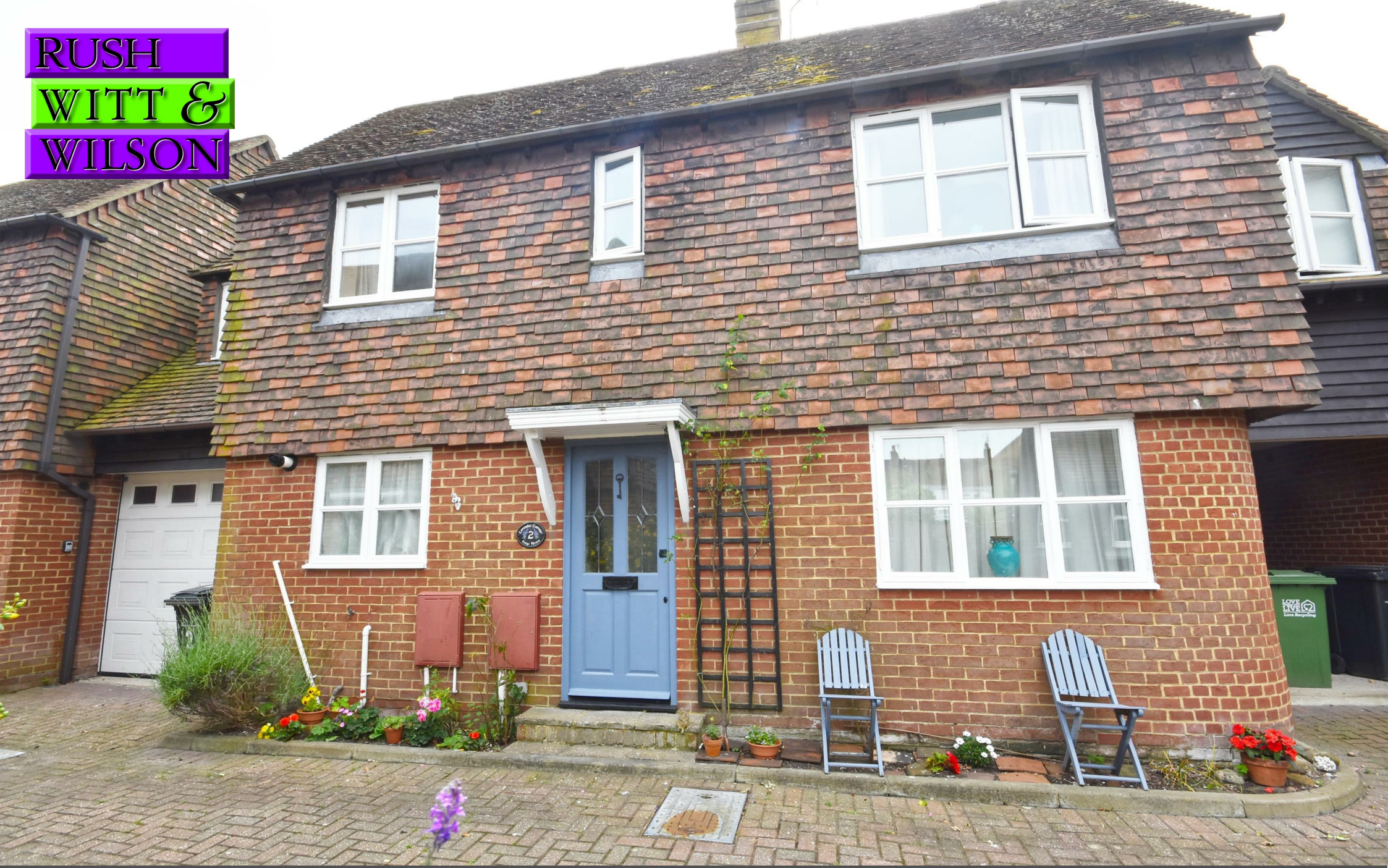
2 Forge Mews, Rye, East Sussex TN31 7DD Guide Price £425,000